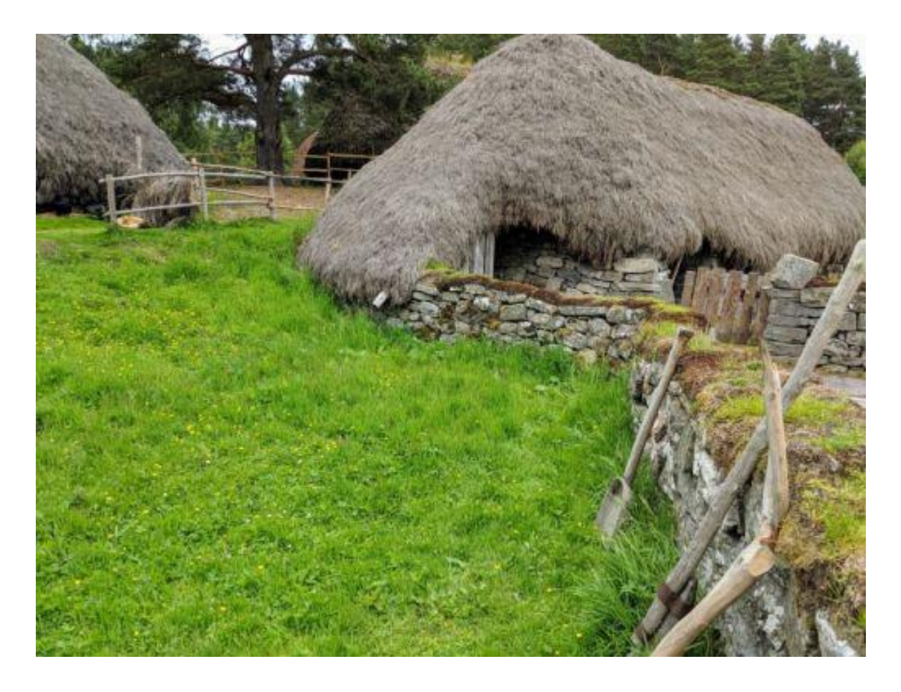
Day 7 – 22 Sept: Travel back south Bit of time in Inverness in the morning / travel back through the Highlands via Loch Ness and Glencoe (packed lunches included, dinner not included)

Day 8 – 23 Sept: Linlithgow & surroundings Studio available all day / possible trips: Blackness Castle, Midhope (Lallybroch in Outlander series), Kelpies / farewell dinner (lunch and dinner included)