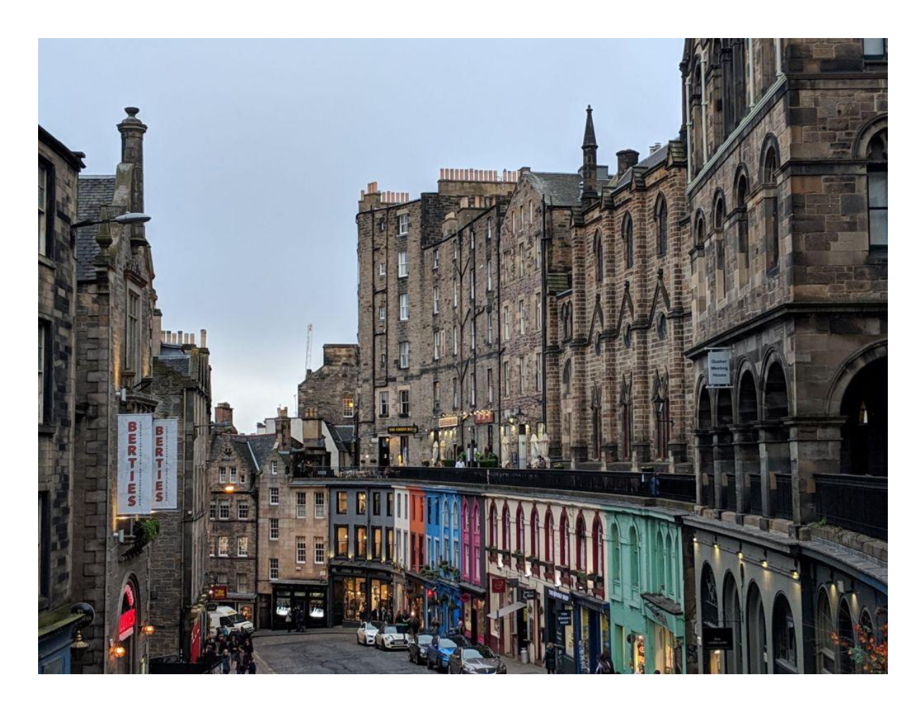
Day 3 – 18 Sept: Edinburgh

Day tour to Edinburgh / Walking and sketching tour with artist guide Nicky Sanderson / Old Town / Royal Mile / National Museum of Scotland & other places (lunch and dinner not included)